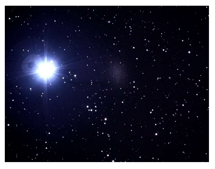
COMET C2018Y1 IWAMOTO MEETS M38 AND NGC 1907 BY BOB KEPPLE