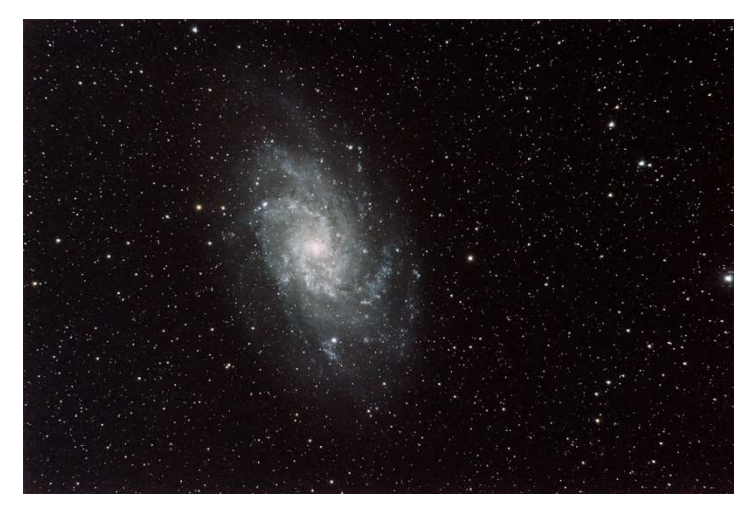
DWB 111 PROPELLER NEBULA BY JAY LEBLANC