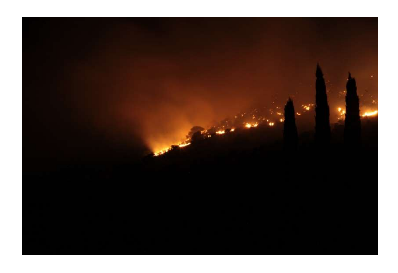
THE CARR CANYON FIRE — BY DAVID ROEMER