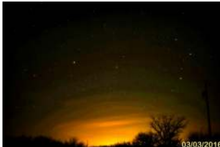
Sierra Vista sky glow as seen from Palominas