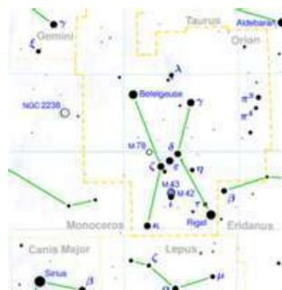
Orion's Belt and the Celestial Equator

Watching Alpha Canis Minoris, Procyon (declination 5.2°) rise in the eastern sky is very interesting. It rises in the east 5.2° to the left, or north, of the Celestial Equator, a distance equal to that between the two pointer stars of the Big Dipper, Dubhe and Merak.