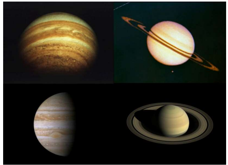
The difference in technology between generations of space probes can be stunning! The top two photos of Jupiter and Saturn were taken by Pioneer 11 in 1974 (Jupiter) and 1979 (Saturn); the bottom two were taken by Cassini in 2000 (Jupiter) and 2016 (Saturn). What kinds of photos await us from future generations of deep space explorers?

What’s next for the exploration of the outer worlds of our solar system? While Juno is currently in orbit around Jupiter, there are more missions in development to study the moons of Jupiter and Saturn. Discover more about future NASA missions to the outer worlds of our solar system at nasa.gov .