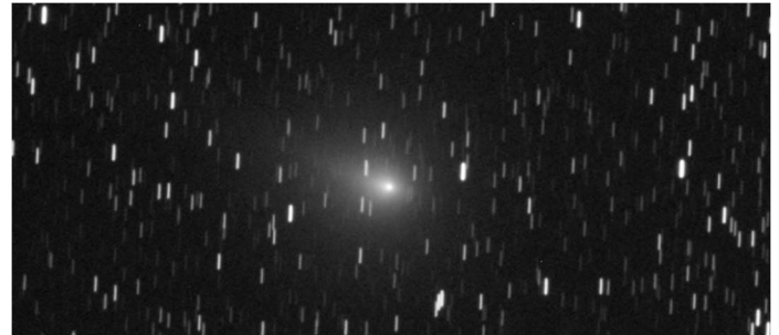
A single 10m Luminance binned 2x2, unguided, w/ orbital tracking enabled.

For those of you who want to sleep at night (a strange concept in my opinion), the Sun has shown some activity recently. Although the consensus is that this will be another quiet cycle, at least there is a hope of spot activity and it should be monitored whenever possible. And hey, at this time of year a nice sunny day isn't too bad to be out in. As always, remember we are at almost 5,000 ft, and the Arizona atmosphere is exceptionally good about transferring UV rays into the human body. So, wrap up and or gloop sun-blocker liberally.